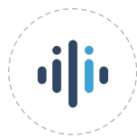
Voca - Agile Voice-Enabled IVR

AudioCodes Voice.AI solutions are deployed at leading organizations in a variety of industry verticals around the world to enhance voice communications, drive efficiency and productivity, and raise levels of customer satisfaction.