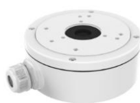
DS-1280ZJ-S Junction box