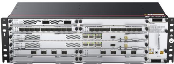
NetEngine 8000 M8 Router (DC)

The NetEngine 8000 M8 can be flexibly deployed at multiple locations on the network. It integrates multiple functions, simplifies the network structure, provides various service types, reliable service quality, and intelligent O&M, and leads the IP WAN towards an intelligent network with autonomous driving, providing continuous and surging power for enterprise customers' business success.