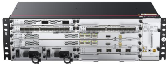
NetEngine 8000 M8 Router (AC)