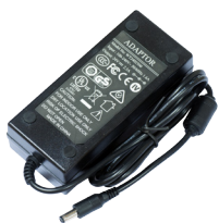
24V 2.5A Power adapter