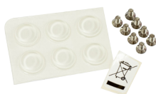
Screw and feet kit