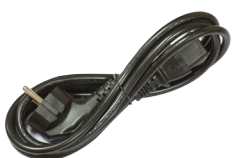
2x IEC cords