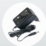
24V 0.8A Adapter