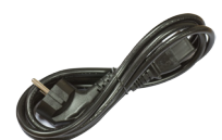
IEC cord (PoE version)