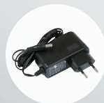
24V 0.38A Adapter