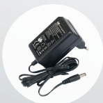
24V 2.5A Adapter