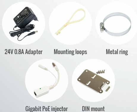
24V 0.8A Adapter Mounting loops Metal ring Gigabit PoE injector DIN mount