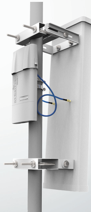
Using the optionally available Flexguide cable, you can use the Basebox with any 3rd party antenna