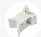
Pole mounting bracket