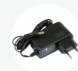
24V 0.38A Adapter