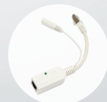
Gigabit PoE injector