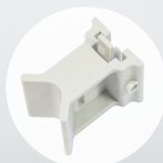
Pole mounting bracket