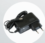
24V 0.38A Adapter