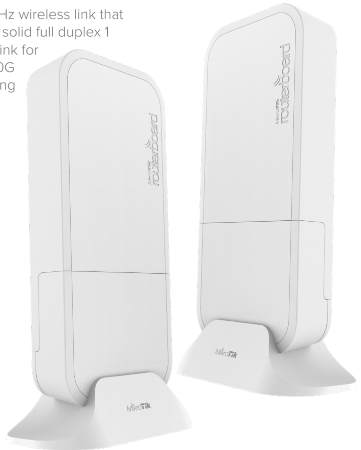
2x plastic straps Table stand

The box includes a wall mounting kit, straps for pole mounting and also a pair of table stands for using the devices indoors. Penetrates some windows depending on material. For more products and information please visit mikrotik.com !