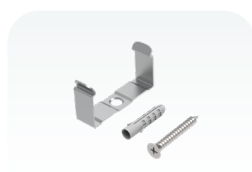
Fastening set (GESP+POE-IN)