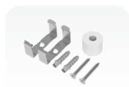
Fastening set (GESP)