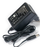
24 V 0.8 A power adapter