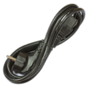
2 IEC cords