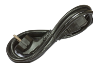
2x IEC cord