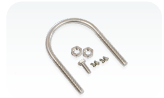
K-70 fastening set