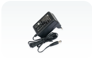
24 V 0.8 A power adapter