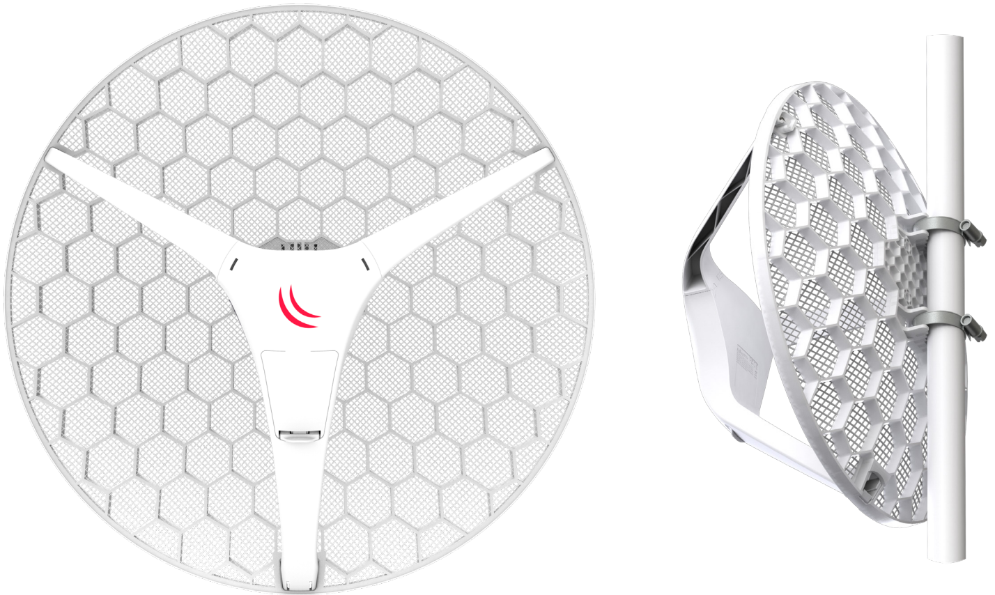
LHG XL 2

The Light Head Grid (LHG) is a compact and light wireless device with an integrated dual polarization grid antenna at a revolutionary price. It is perfect for point to point links or for use as a CPE at longer distances. We have two 2.4 GHz models available - LHG 2 with 18 dBi and LHG XL 2 with 21 dBi grid antenna.