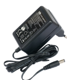
24V 0.8A Power adapter