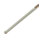
Dual Band 2.4/5Ghz (6dBi 2.4Ghz, 8dBi 5GHz)