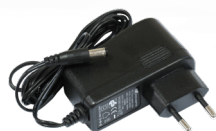
24 V 0.38 A power adapter