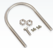
K-70 fastening set