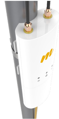
C5c on Pole