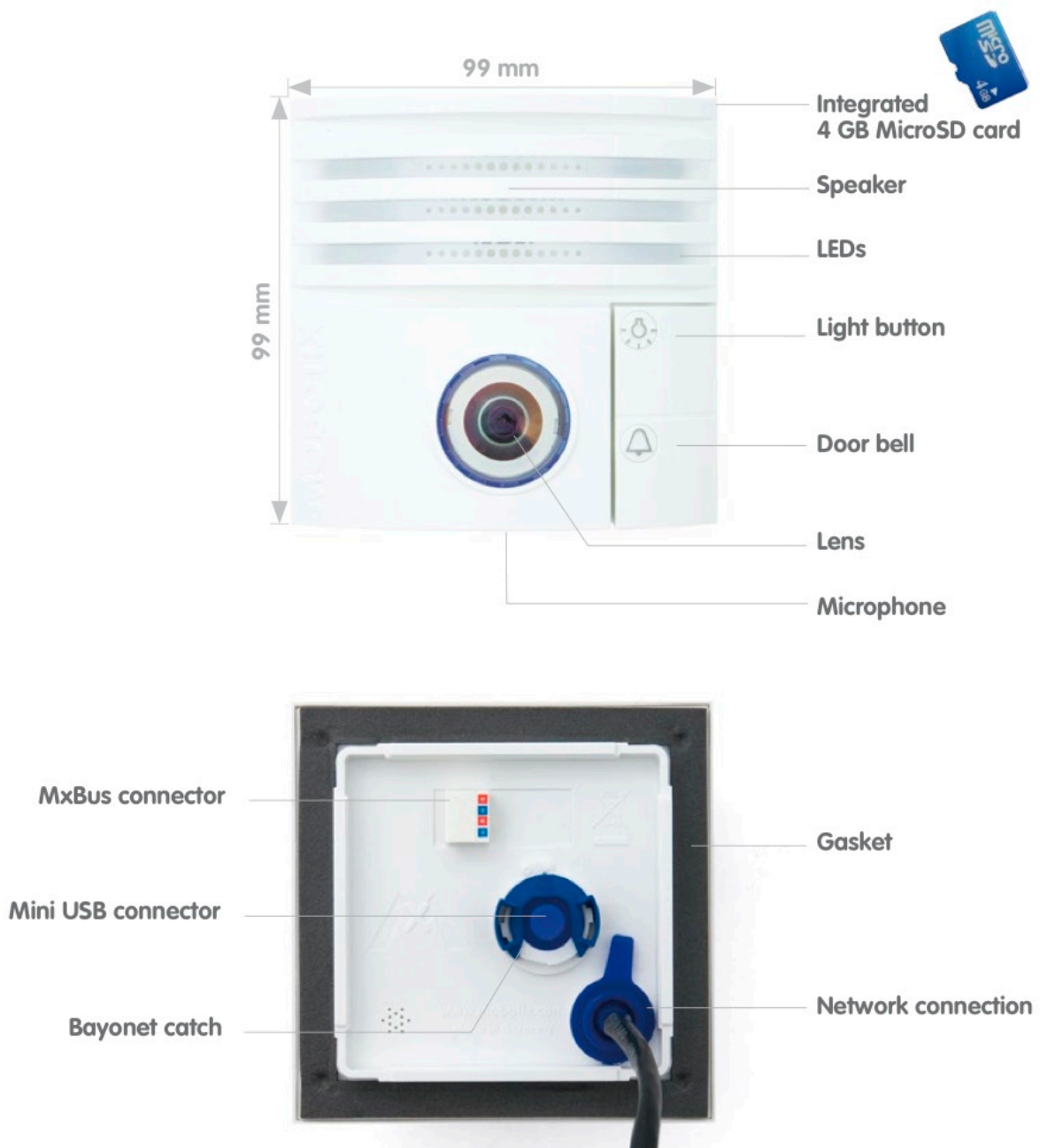
(T25 – Camera housing and connectors, excerpt from the technical documentation)

However, due to technical reasons, it is necessary to exchange an older existing T24-DoorMaster for the new MX-DoorMaster (article number: MX-Door2-INT-PW).