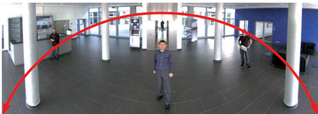
Wall-mounted i25 captures 180° field of view – no blind spots.