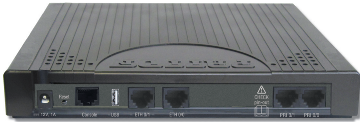
2-Ethernet-port upgradeable option