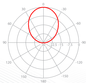
V/H - Port Pattern Azimuth 5.6 GHz