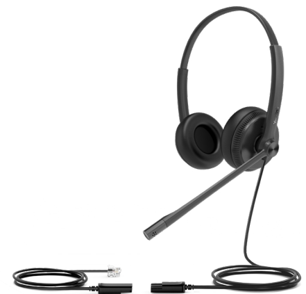
YHS34/YHS34 Lite Dual