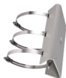
DS-1275ZJ Vertical pole mount