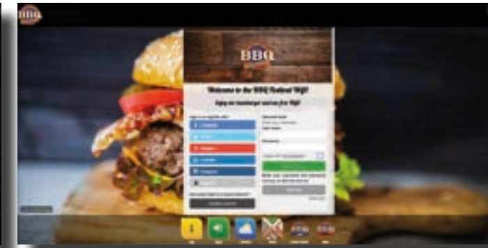
Welcome Portal Example 2