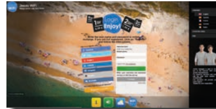
Welcome Portal Example 1