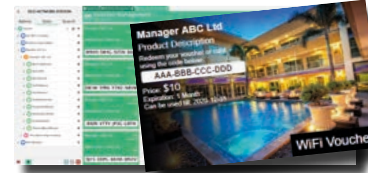
Vouchers and Cards